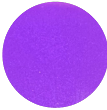
Jinx Neon Jelly