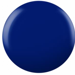
Into the Deep