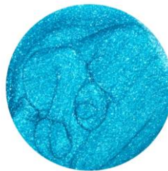
Sea Mist/ S