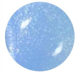
Bounce / S