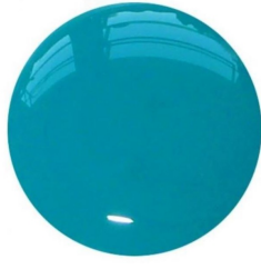
In The Cosmos