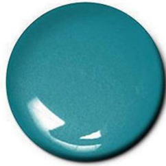
Burnished Patina /S